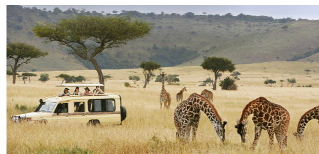
With parks like the Nakuru National Park and the Maasai Mara as well as perfect beaches and stunning mountains, Kenya offers a rich natural and cultural experience.

We are also hosts of the IAPS Orchestral Weekend, the major musical event of the schools' calendar, and have a superb standing in the choral realm.